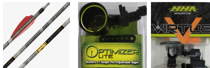
1 dozen - Gold Tip Black Label arrows HHA Optimizer Lite Adjustable Sight HHA Virtus Drop-Away Arrow Rest