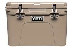
YETI Tundra 35 cooler - PermaFrost Insulation - Includes one dry goods basket