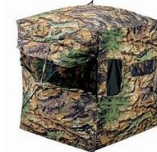
Primos Smack Down Ground Blind - Floor Space 25 sq. ft - Height 70"