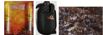
Lumenok HD Lighted Nocks Wiebe Big Game Skinning Combo Carl Benders wildlife print

***Three (3) Blackhawk Bowhunters annual memberships (non-working)***