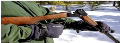
Chiappa Double Badger Folding .22 LR / .410 Shotgun - Williams high-visibility fiber-optic front bead sight, and an adjustable high-visibility ghost-ring rear sight - Double triggers